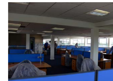
Six weeks after

Fit-out introduces open plan office space within a light and airy environment with bespoke finishes.